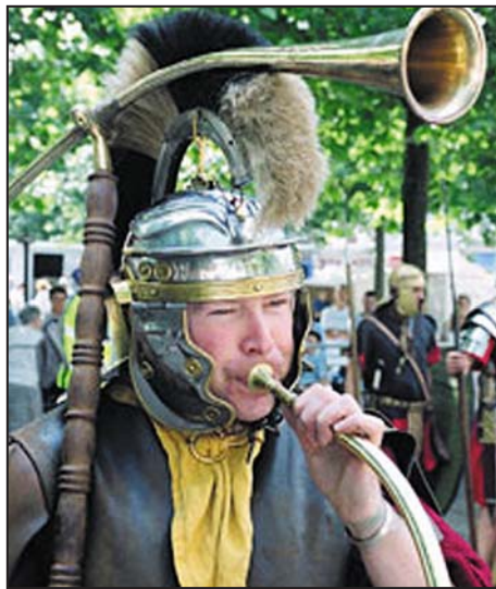
York Eboracum Annual Roman Festival

From the city walls near Monk Bar you can see the remains of the east corner tower of the Roman fortress, the site of York's first archaeological excavation in the 1920s. Clearly visible are three walls of a corner tower more than 18 centuries old which may originally have stood as much as 7-8m high. From here in Roman times you would have seen rows and rows of the long, low barrack buildings where the soldiers lived.