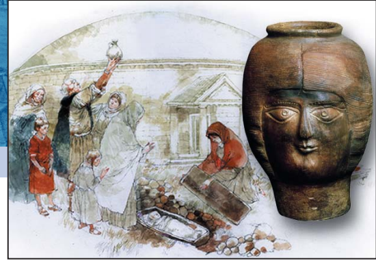
Head pot used for burial