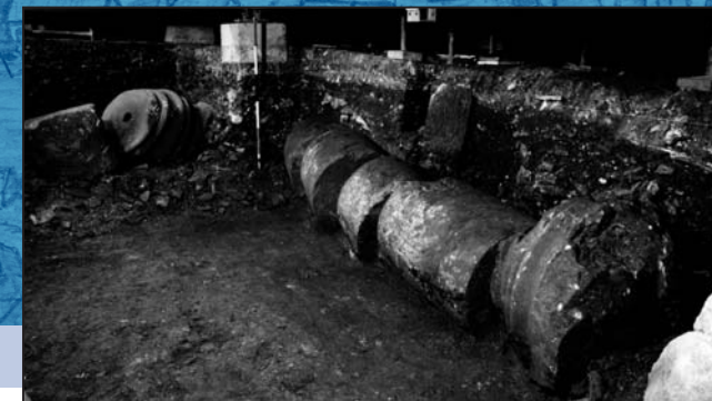
Photo of the collapsed Roman column as found by archaeologists beneath the Minster

The junction of Petergate and Stonegate lies on the site of the junction of the two most important streets of the Roman fortress, the via praetoria which led to the main gate (St Helen's square), and the via principalis which joined the north-west and south-east gates (at Bootham Bar and King's Square).