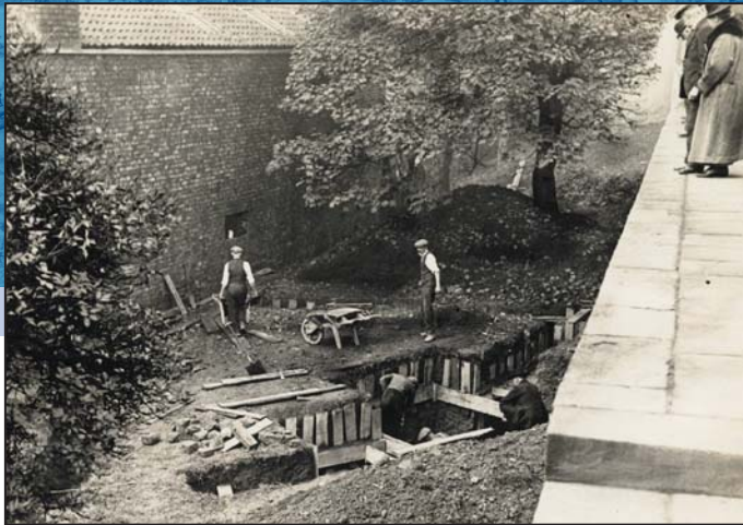
Excavation of the Aldwark Tower