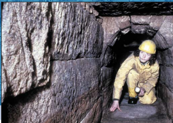
The Roman sewer underneath Church Street

Close to the line of modern Stonegate, there was a Roman street (via praetoria) with buildings tightly packed on either side leading to the great legionary headquarters where the Minster now stands.