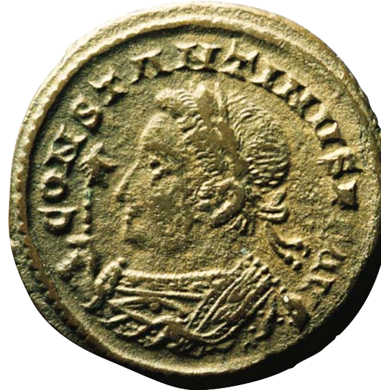
A Roman coin featuring the head of Constantine

From Monk Bar you can return to Bootham Bar by walking in the footsteps of Eboracum's Roman defenders as this section of the city walls stands exactly where the Roman fortress defences stood almost 2000 years ago.