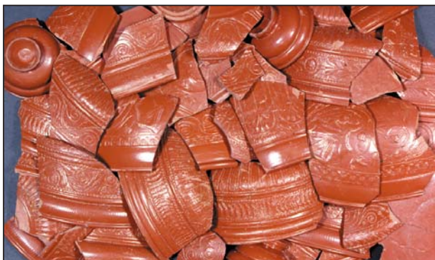
Roman Samian Ware from York

The museum gardens are also home to one of the finest collections of Roman artefacts in Britain. The Yorkshire Museum recalls in fascinating detail the history of the Roman settlement of Eboracum.