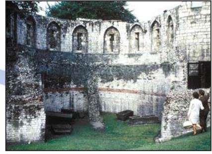
Take a look inside the Multangular Tower

In the car park next to the council offices is a small piece of the Roman fortress wall which was broken through when the street was created in 1834.