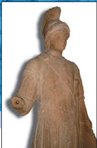
Statue of the God Mars