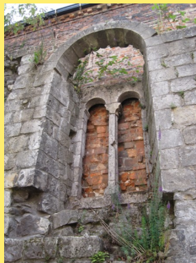
The Norman House

The history of the Jewish community in York is a fascinating, if often overlooked, chapter in the city's long and colourful past. Whilst attention is usually focused on the tragic event at the site now called Clifford's Tower, there are stories to be told about the resiliency of the medieval Jewish community and of commemoration and revival of Jewish life in the more recent past. Along the trail, we will discover the sites of synagogues both ancient and new, meet prominent historical Jews such as Aaron of York and the unfortunate Benedict, explore the remains of a 12th century house and the place of the medieval Jewish burial ground, and finally reflect on tragedy and remembrance at Clifford's Tower itself, where Jewish families tragically died on 16th March, 1190.